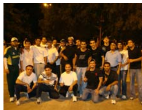
8th Annual Cricket Tournament