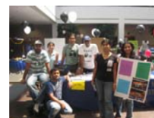
Students Org Expo