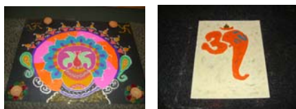
Rangoli-ISA Diwali 2008

Known as the festival of lights, Diwali is ISA’s biggest event . The lights represent hope and positive thinking as well as the victory of good over evil. Diwali is observed over a 5 day period, the third day being a New Year celebration. ISA celebrates Diwali on a grand scale, befitting the most widely celebrated festival in India. The celebrations take place in the Atrium II of the Bayou Building, the entire place is decorated with Indian decorations, costumes, informative posters. The entire place is lit up with different kinds of lighting like Kandils, hanging lights, diyas, kandils, candles and lanterns. The Indian Students Association brought this event to the UHCL campus on Nov 1. The festivities, which included traditional Indian food, music, dancing, and an assortment of lights and decorations, was a home away from home for many of the UHCL Indian students.