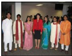
UH Chancellor with ISA-EC 2008-09

Indian Student Association is one of the well known organizations among others in the university. Today with a membership of over 600 members, around 200 currently enrolled at UHCL, ISA is working hard together with Student Service Offices in the University to help and assist Indian Students from the time they contact ISA till they graduate from UHCL. Helping each other in times of need is what brings us together and aids us in strengthening our community. Exchange of cultural values and spreading Indian Cultural among the various individuals who are a part of UHCL and bringing the community in Houston in touch with the students community has been an achievement of ISA. ISA is easily accessible through its website www.isauhcl.org . This website not only caters to the needs of UHCL students, but also provides valuable information to non-UHCL students.