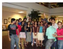
Welcome Back Dance