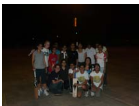
Girl's Cricket Team 2008

Indian Students Association hosted the eighth annual ISA Cricket Tournament in July. ISA organized its first cricket tournament in 2001. Started primarily for UH-Clear Lake students, the tournament now draws more than 15 teams and over 150 players. Past tournaments have included UH-Clear Lake students and alumni, students from UH, San Jacinto Community College and Clear Lake High School as well as community.