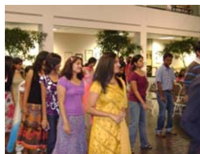
ISA's Last Event Welcome party . October 3rd, 2008

ISA provides a temporary place for new students to stay until they are able to find an apartment of their own. This Semester, ISA provided temporary accommodation to 110 new Students.